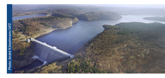
The Rappbode Dam supplies the region with drinking water

Ten automatic measurement stations record the concentration of DOC not only at the dam and its outflow, but also in the main tributaries, the rivers Bode, Hassel and Rappbode, which are also impounded by auxiliary dams. This way,