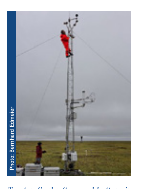
Torsten Sachs (top and bottom images) and Matthias Mauder (right) conducted field measurements during earlier projects; in the future they aim to do research with their own teams of junior researchers at TERENO observatories

The young researchers both make use of the comprehensive measurement infrastructure at the TERENO observatories. Torsten Sachs (34) monitors the climate relevant exchange of the greenhouse gases carbon dioxide and methane in rewetted marshes at the TERENO observatory "North-East German Lowlands". "Soil, vegetation and atmosphere are closely linked. We have to understand the vertical exchange of gases and energy in order to incorporate it properly into climate models. Up to now, data on these energy and gas flows have mostly been limited, covering