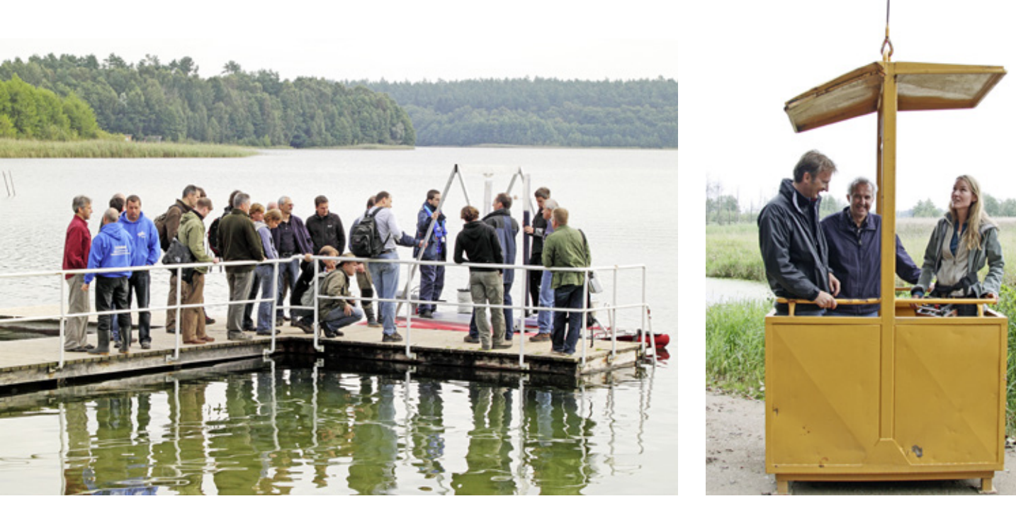
Down deep and up above: Preparing the floating platform to collect samples from the bottom of the lake; the gondola transports researchers up high to examine the canopy