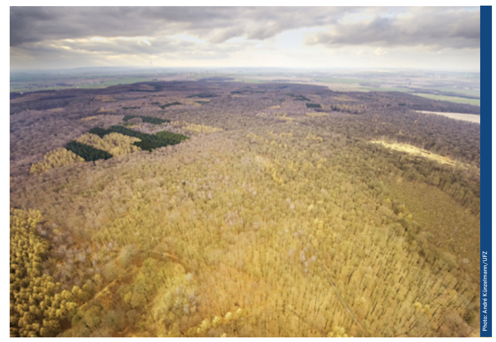
the future, Tandem-L can be used to better monitor forest changes. Pictured here is the "Hohes Holz" woodland, one of the locations within the TERENO observatory "Harz/Central German Lowland"

Satellite mission Tandem-L: Monitoring dynamic processes on Earth with great accuracy for the very first time