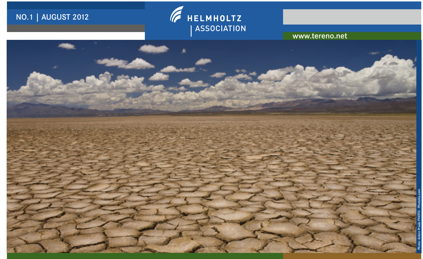
Unpredictable precipitation levels, extreme weather events and longer periods of drought – climate change has already become very noticeable in West Africa and the Mediterranean region. TERENO is helping to establish observation networks in these regions