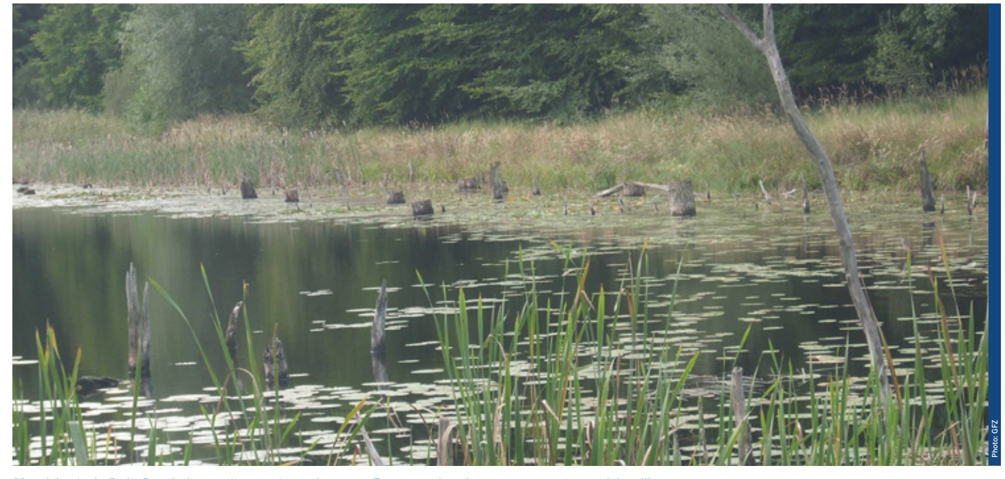
Many lakes in the Berlin-Brandenburg region contain ever less water. Tree stumps have begun to reappear in some lakes, like the Redernswalder See. As part of the TERENO project, scientists are researching hydrological processes to determine why water levels rose over the last century and why they are falling today